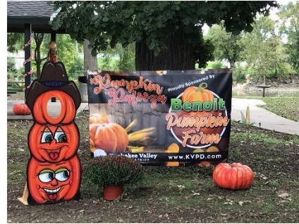
Pumpkin Palooza 2018