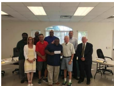
Vernon Wellness Donation