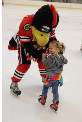
Re-Grand Opening of Ice Valley