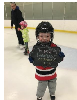
1 st Day of Skating