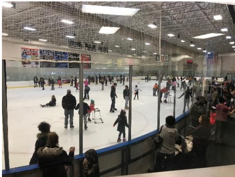
Winter Fest @ Ice Valley