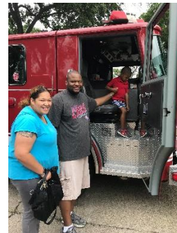
Touch A Truck