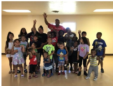
We Stand For Chirst Jesus Ministries & Norther Food Bank Lunch @ Pioneer