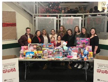
Toys for Tots