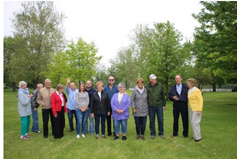
Cobb Park Re-Plant Tree Donors

Check out our Video's online ( www.kvdp.com/info/videos )